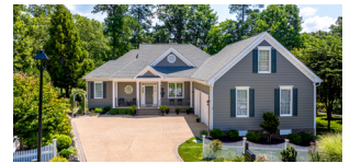
215 PORTSTEWART 3 BD | 3 BA | 3,534 SF | $869,000