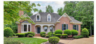
106 TROON 4 BD | 3.1 BA | 3,309 SF | $799,000