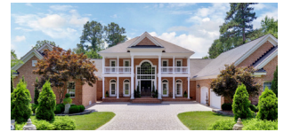
215 WATERTON 5 BD | 3.2 BA | 5,971 SF | $1,599,000