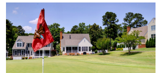
105 HOLLINWELL 2 BD | 2.1 BA | 2,625 SF | $665,000