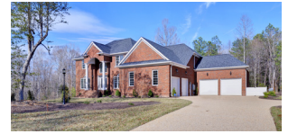
4700 LOCKLOMOND 5 BD | 3.1 BA | 5,987 SF | $1,199,000