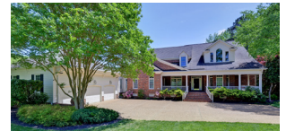
169 WATERTON 6 BD | 4.1 BA | 6,595 SF | $1,199,000